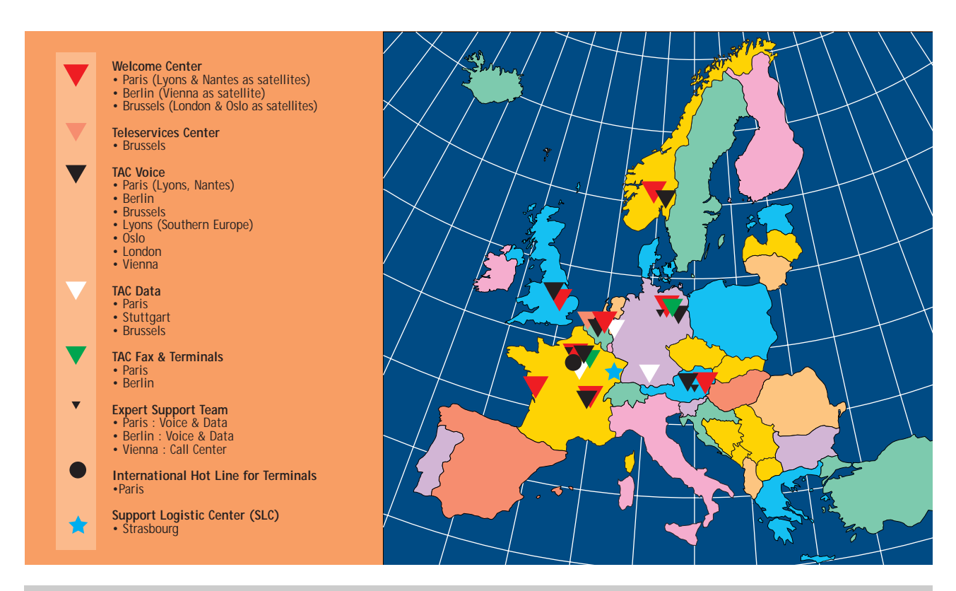
Figure 3 – Locations of Alcatel's Customer Call Centers and Support Logistics Centers

Currently, a customer in Barcelona who has a problem with its Alcatel equipment simply dials a toll-free number in Spain and is answered in Spanish by an agent at the Lyons call center. A specialized TAC engineer in Lyons will conduct a diagnosis, possibly with the help of an expert in Paris or Stuttgart. A