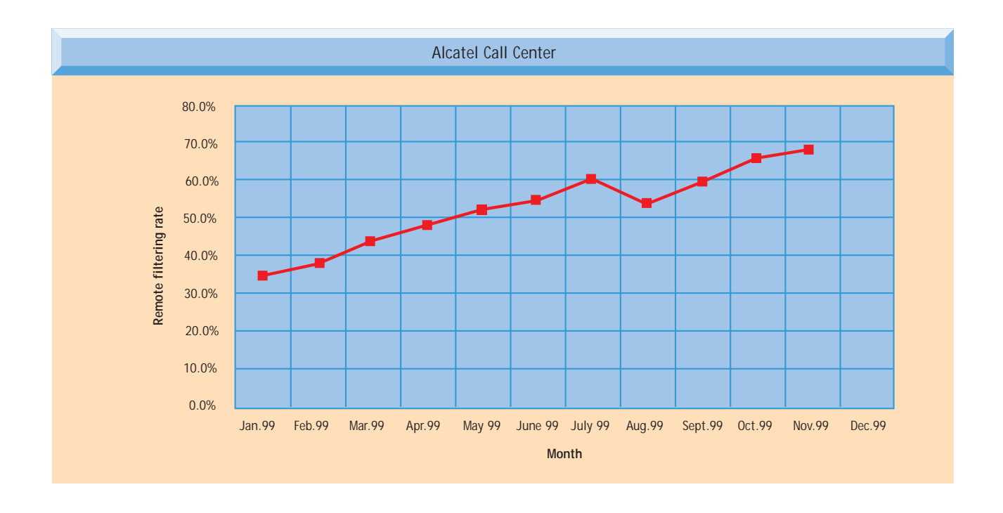
Figure 4 - Filtering rate evolution

dispatcher in Madrid will organize any intervention that is required, and a technician in Barcelona will visit the site to change the defective board (see Figure 3 ).