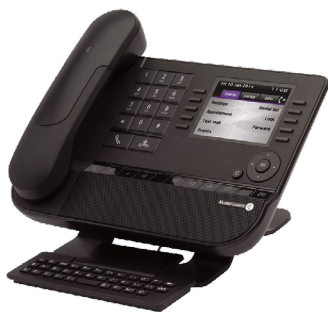
8068 IP Premium DeskPhone