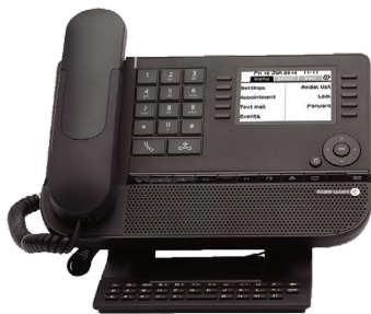
8038 IP / 8039 TDM Premium DeskPhone