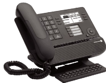
8028 IP / 8029 TDM Premium DeskPhone